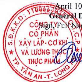
Le Truong Son